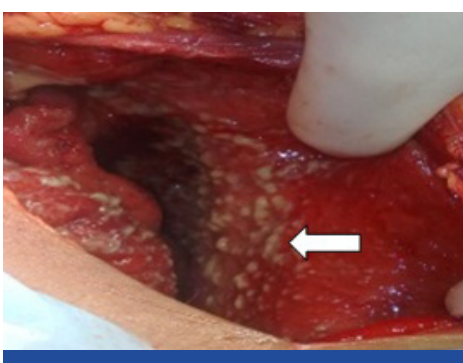
[Table/Fig-1]: Flakes covering peritoneal cavity

Due to antibiotic use in any intervention, gangrenous cystitis is now a very rare condition. It may vary from necrosis of mucosa to necrosis of entire bladder wall. The aetiology is usually multifactorial and identification of single particular cause is difficult [1]. Usually occurs in elderly, mainly affecting patients with co-morbidities like diabetes, spinal cord injuries, pelvic malignancies or stones [2]. Indexed patient was a young female without any co-morbidity. Causative agents include direct or indirect causes. Direct factors lead to direct damage to bladder wall like chemicals, radiation or widespread infection. Indirect factors interfere with blood supply leading to bladder ischemia & hence gangrene. Indirect causes include over distension of bladder secondary to chronic urinary