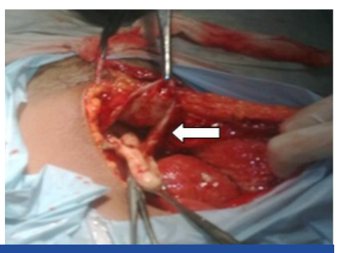
[Table/Fig-3]: Necrotic bladder wall